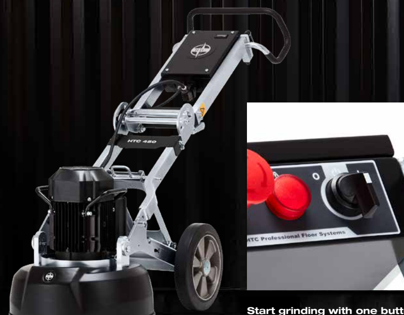
Start grinding with one button The start/stop button is all you need to start grinding.

When function and design interact, you feel the difference. HTC's new smaller machines have features that will make your work both simpler and safer.