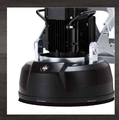
Keep grinding dust under control A floating grinding hood that responds to floor irregularities means improved dust extraction.