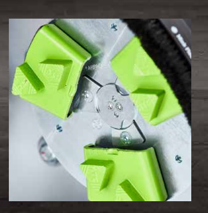
Quickly change tools The EZchange™ system speeds tool changes and gives you access to a wide range of HTC tools.