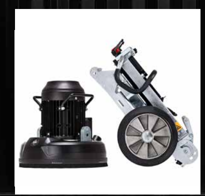
Collapse and transport Easily separate the motor and chassis, to collapse and transport.