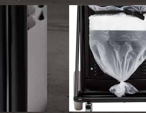
Longopac®-system Handle dust easily and safely in Longopac® collection bags.