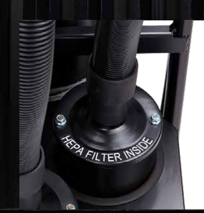
3-step filtration Dust extractors effectively separate the dust into three steps with a whirler, primary filter and HEPA H13 filter.